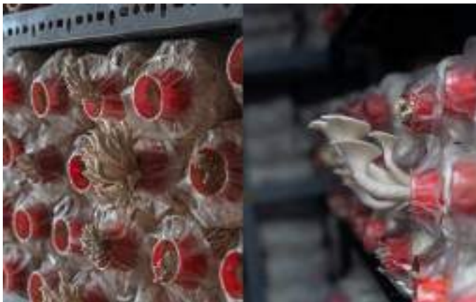
Mushrooms grown in a container by staff of E4PID

An initiative by SNCF’s affiliate Employment for Persons with Intellectual Disabilities (E4PID), Mushroom Buddies occupies two container lots at Sprout Hub. Wholly run by volunteers and staff with special needs, Mushroom Buddies grows, harvests, and sells organic and nutrient-rich oyster mushrooms and lion’s mane mushrooms.