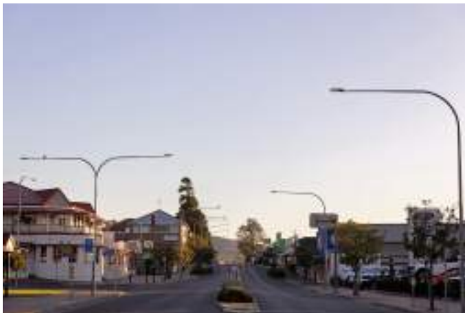
Operational Area of Care Together: A shot of Moruya and its surrounding in remote/rural area of Australia.

When people in community settings are empowered to cooperate on the care they receive or build the capacity of caregivers and care workers to determine how they provide care, then service quality improves, and the care workforce grows.