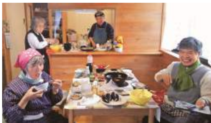
Cooking & Delivery Services by Health & Medical Cooperatives in Japan

Cooperatives in the care economy play a vital role in meeting the growing demand for childcare, eldercare, and mental health services. These cooperatives use a multi-stakeholder governance model that brings together service users, care providers, families, and community agents. This inclusive approach ensures that services are holistic and responsive to the needs of all parties involved. Notably, cooperatives in the care sector help improve wages and working conditions for care workers and address the prevalent issues of low pay and precarity in the industry.