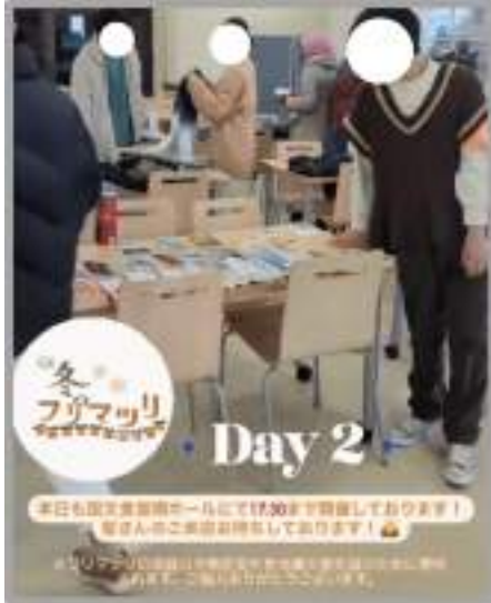
A social media post highlighting Kobe University Coop's Student Committee Winter Flea Market

reported to members via the university coop's website, fostering a sense of community involvement and accountability.