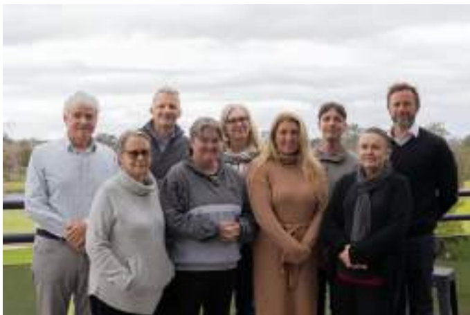
The Core Operational Team of Care Together

a half years to explore a different way of operating that will prioritise the needs of both the people receiving care and those of the caregivers.