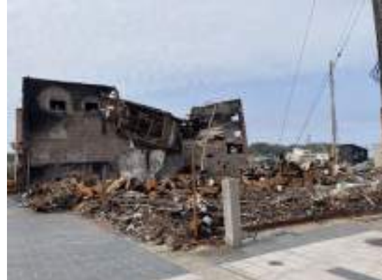
Totally burned down house

Upon visiting the affected areas, it became apparent that restoration work is still ongoing. Despite the efforts, most homes that suffered even partial damage remain abandoned, with many residents relocated to shelters or temporary housing. Unfortunately, this situation meant that less than half of the mutual insurance policyholders were present during our visits. The restoration process is prioritizing infrastructure, such as roads and water supply, as these are crucial for facilitating the movement of construction vehicles like cranes and dump trucks necessary for clearing and rebuilding homes and facilities.