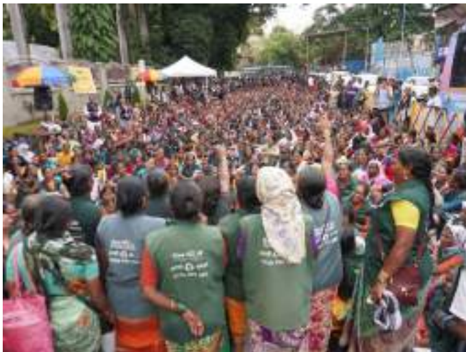
Cooperative governance in action

The operational governance of the cooperative is led by waste pickers elected/ nominated from membership blocks aligned with the administrative units ('kothis') of the PMC. This council of 180, forms the parliament of the cooperative and meets every month to take decisions, share information, build solidarity and hold the cooperatives' administration accountable for their responsibilities. The representatives are active waste pickers and community leaders navigating citizen, PMC and waste picker complaints, resolving grievances