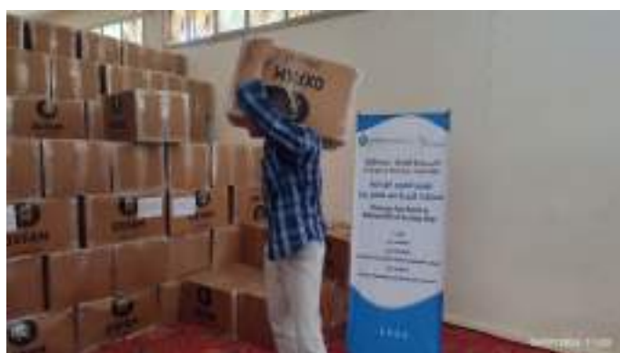
A humanitarian worker arranging the boxes of emergency supplies in Gaza

The ongoing crises have also taken a toll on social stability. Rising poverty and shortages of essential goods have strained vital services such as education and healthcare, leaving many families dependent on humanitarian aid for their daily survival. Repeated conflicts and crises have further impacted mental health, particularly among children and youth, contributing to long-term psychological effects. Politically, internal divisions between Gaza and the West Bank have hindered a cohesive Palestinian political framework, weakened national unity and limited the leadership's ability to negotiate on critical issues. This fragmentation, coupled with regional security pressures, has diminished avenues for advancing the Palestinian cause and fuelled public frustration over deteriorating living conditions and the lack of sustainable solutions.