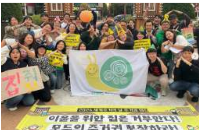
Minsnail Housing Coop Community in Action

Similarly, in India, housing cooperatives have emerged as a critical tool for addressing urban housing challenges. By providing affordable housing solutions and facilitating community-driven management, residential cooperatives improve urban living while addressing issues like infrastructure maintenance, security, and waste management. These cooperatives, particularly in cities like Mumbai and Delhi, have grown significantly and continue to benefit millions of residents.