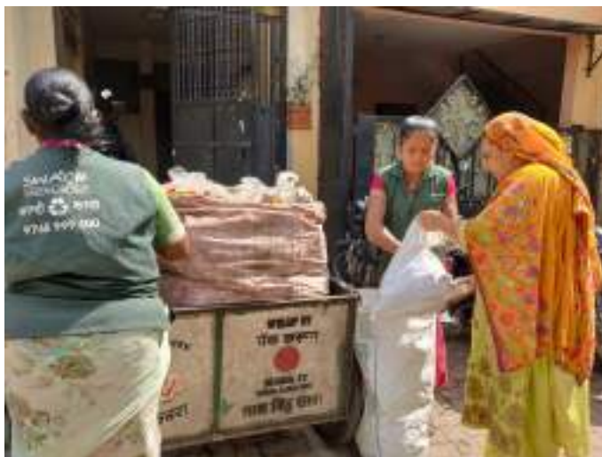
SWaCH workers collecting waste

Today, the green SWaCH coats and orange pushcarts are ubiquitous in Pune as 3950 waste-pickers provide waste collection service to over 40 lakh citizens of Pune (68% of the city), including 10 lakh slum dwellers. They ensure close to 100% segregation at source, divert 200 tons daily (2 lakh Kg) towards recycling and hand over segregated wet and dry waste to the PMC's vehicles. In lieu of their immeasurable contribution, PMC provides social welfare cover in the form of accident and life insurance, medical insurance, scholarships for children of waste-pickers and access to subsidised healthcare through its network hospitals.