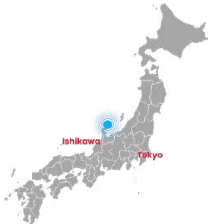
The 2024 Noto Peninsula Earthquake epicenter

The 2024 Noto Peninsula Earthquake, which struck at 16:10 on January 1, 2024, was a powerful seismic event with a magnitude of 7.6, reaching a maximum intensity of 7—the highest level on the Japanese scale. This earthquake caused widespread devastation across the Noto Peninsula in Ishikawa Prefecture, leading to landslides, fires, liquefaction, and the collapse of numerous homes.