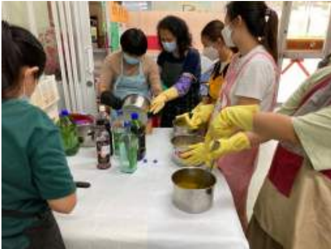
Eco-Cleaning Aunties Coop in Hong Kong

In urban centers across the Asia-Pacific region, cooperatives are empowering domestic workers by formalising employment, ensuring fair wages, and providing social protection. For instance, in Hong Kong, the Hong Kong Women Workers' Cooperatives, established by the Hong Kong Women's Association (HKWWA), and the Hong Kong Babysitting Coop exemplify how worker cooperatives support marginalised women, particularly in low-wage, informal employment. Cooperatives like the Eco-cleaning Aunties Coop in Hong Kong focus on producing eco-friendly products while fostering a supportive community for women. This cooperative provides