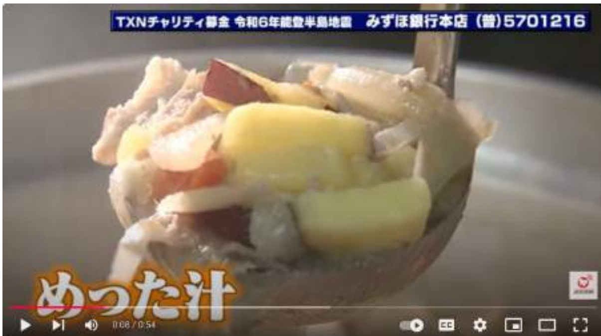
A TV Aichi feature on the Metta-jiru initiative by university cooperatives

The initiative spread throughout the Tokai Block, a branch of NFUCA in the Tokai region, with university coops at Nagoya University, Shizuoka University (Hamamatsu Campus), Nagoya Institute of Technology, and Aichi University for Education all participating in similar efforts.