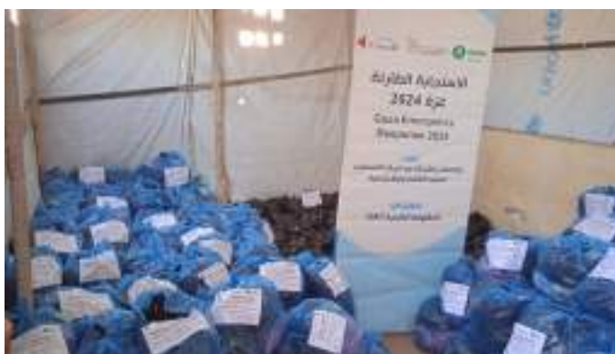
Emergency response material during Gaza crisis

ESDC's approach to cooperatives goes beyond traditional models of support. By pooling resources and providing specialized training, ESDC helps cooperative members overcome the economic challenges imposed by the fragmented nature of Palestinian resources and land. The ESDC ensures that its initiatives align with Palestine's National Policy Agenda, contributing directly to the country's broader development goals. ESDC's team of skilled agronomists, marketing experts, and business development specialists further strengthens its support framework, enabling cooperatives to improve agricultural practices, expand market access, and build business resilience.