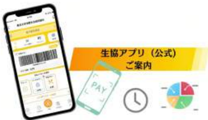
University Coop App by NFUCA, Japan

University cooperatives in Japan and Korea provide students and faculty with essential services, including affordable meals, credit facilities, and housing. These cooperatives not only improve the daily experiences of university members but foster youth engagement also by allowing students to participate in governance and decision-making. This involvement nurtures future leaders by integrating cooperative values into education, empowering students to apply these principles to real-world challenges. For instance, university coops like Keio University Coop in Japan provide discounted textbooks, meal plans, and other student services while fostering a sense of community and solidarity. Affordable housing has also been a service that has been offered by university cooperatives in expensive metro cities.